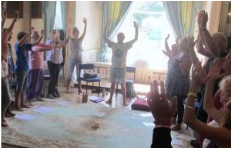
Photo: ANGELS OF SOUND voice playshop at Summer Gathering, Wimborne 2014

The Power of Pure Sound covering the above plus: Who Are The Elohim? What Is A Pure Sound? Pure Sound beneficial effects-- Brainwave Sates-- Kymatic images of Dean's crystal and Tibetan bowl collection